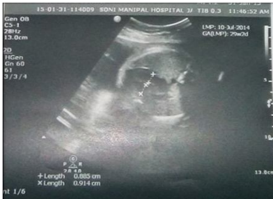
Fig. 2: Mild right ventricular dilatation